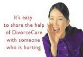
It's easy to share the help of DivorceCare with someone who is hurting.